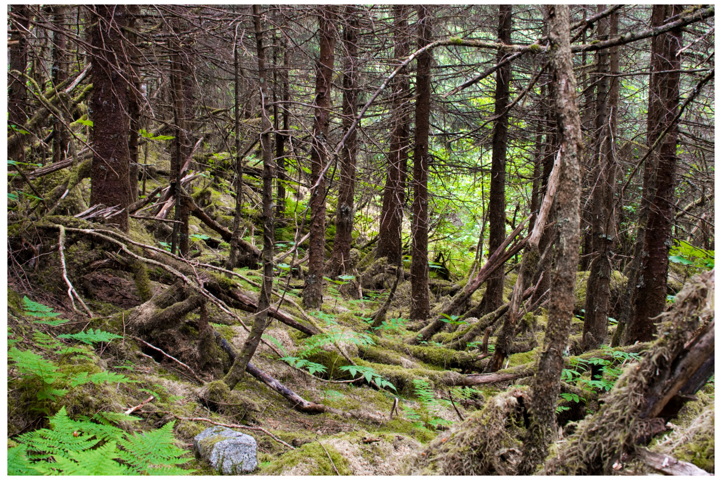
"Forest" by andrewmalone is licensed with CC BY 2.0. To view a copy of this license, visit https://creativecommons.org/licenses/by/2.0/