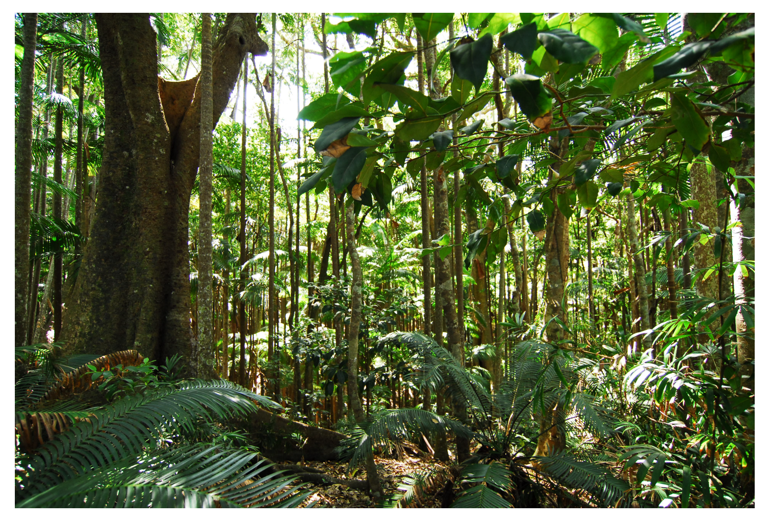
"Rainforest" by WanderingSolesPhotography is licensed with CC BY 2.0. To view a copy of this license, visit https://creativecommons.org/licenses/by/2.0/