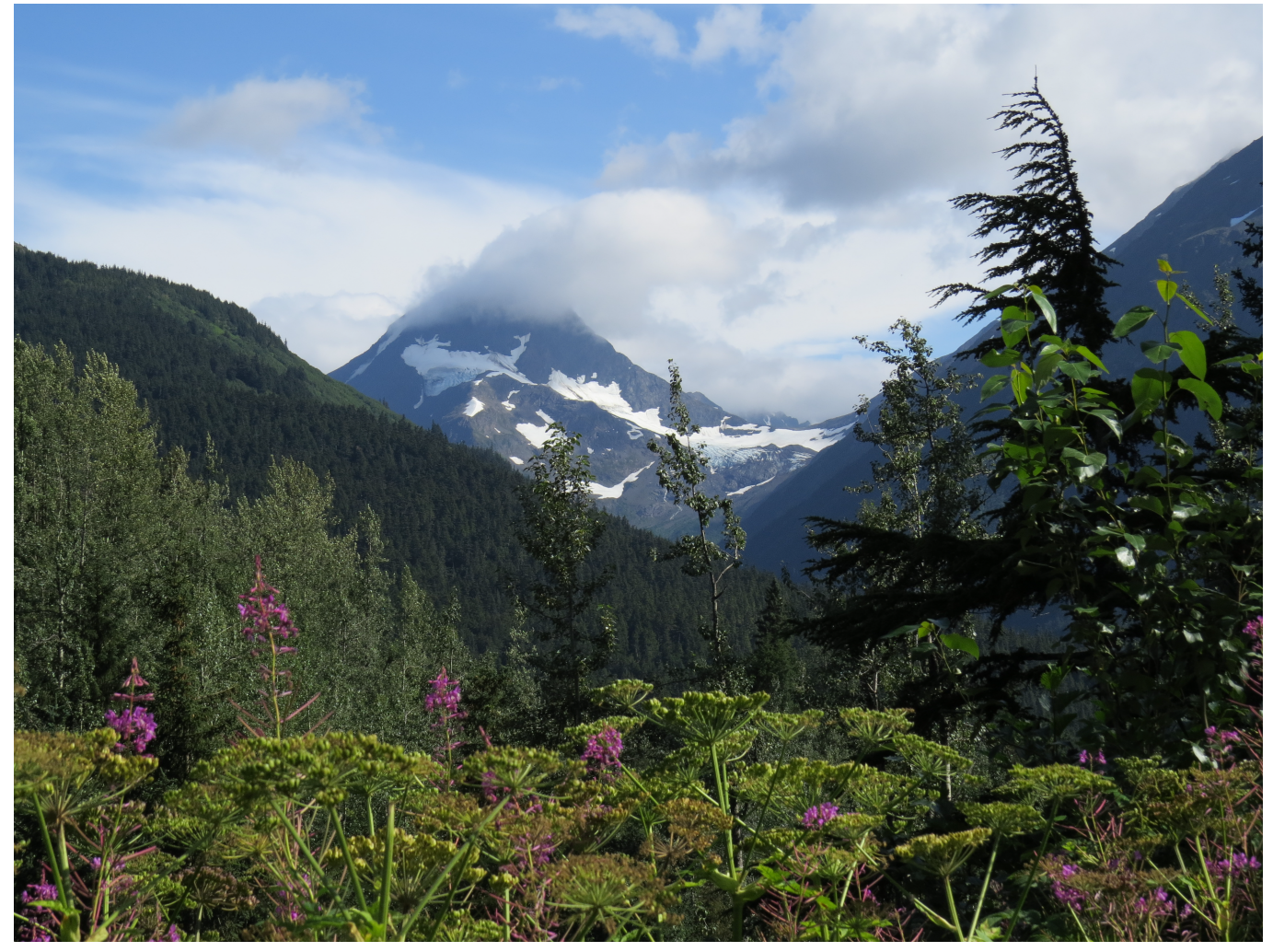
"Scenic Alaska Mountains" by Accretion Disc is licensed with CC BY 2.0. To view a copy of this license, visit https://creativecommons.org/licenses/by/2.0/