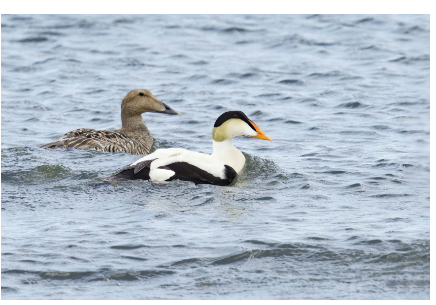
"Common Eiders" by Mick Thompson1 is licensed with CC BY-NC 2.0. To view a copy of this license, visit https://creativecommons.org/licenses/by-nc/2.0/