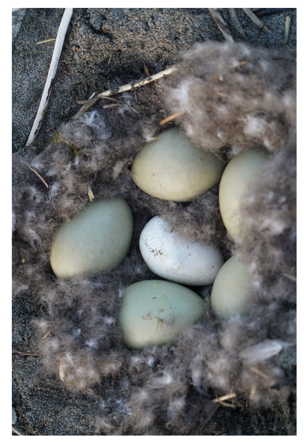
"Common Eider Nest" by USFWSAlaska is licensed with CC BY-NC-ND 2.0. To view a copy of this license, visit https://creativecommons.org/licenses/by-nc-nd/2.0/