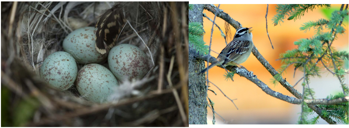
"White Crowned Sparrow's Nest" by DenaliNPS is licensed with CC BY 2.0. To view a copy of this license, visit https://creativecommons.org/licenses/by/2.0/