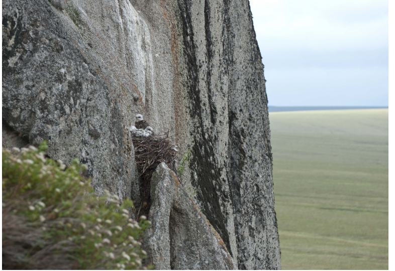
"Chicks" by Bering Land Bridge National Preserve is licensed with CC BY 2.0. To view a copy of this license, visit https://creativecommons.org/licenses/by/2.0/