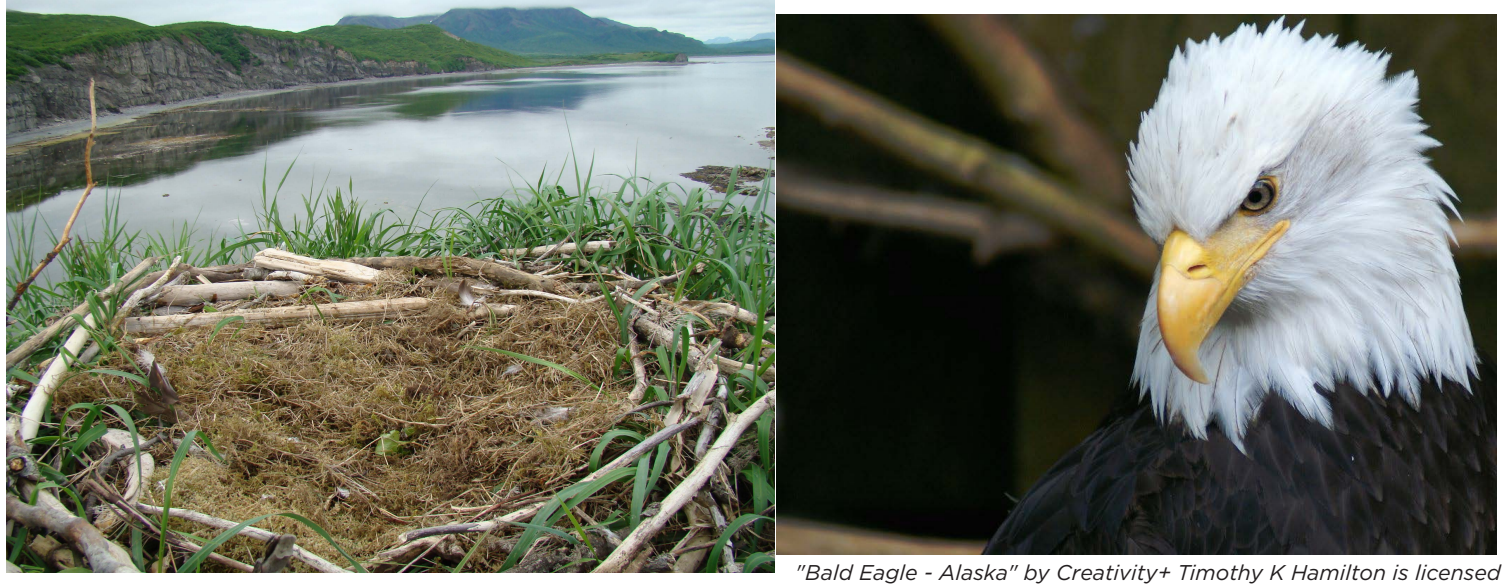
"Eagle Nest View" by Buzz Hoffman is licensed with CC BY-NC-SA 2.0. To view a copy of this license, visit https://creativecommons.org/licenses/by-nc-sa/2.0/