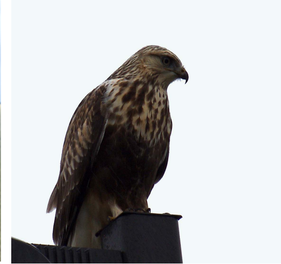
"Rough-Legged Hawk"