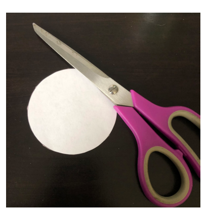
2. Cut out your button background.

3. Create any design with paper elements and glue into place.