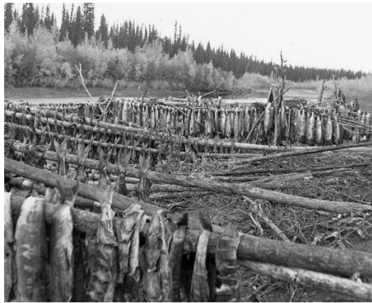
B1985.027.1212 Drying racks with fish in Fort Yukon, AK.