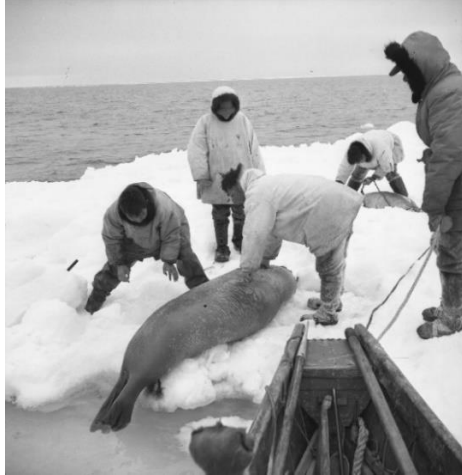
B1990.014.5.AKNative.3.170 Men hunters pulling out a dead seal.