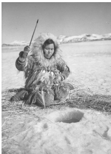
B1993.091.0171.R05 Woman ice fishing.