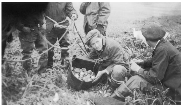
B1996.011.104 Young man holds a basket of collected murre eggs at Pribilof Island.