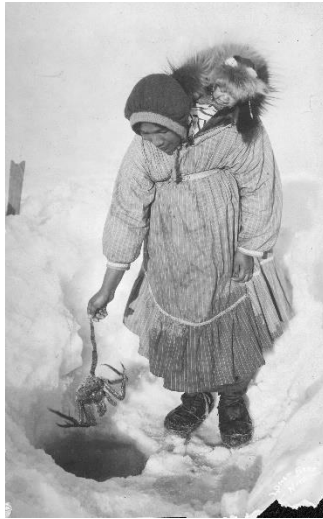
B1970.028.21 Woman with child ice crabbing.