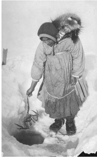
B1970.028.21 Woman with child ice crabbing.