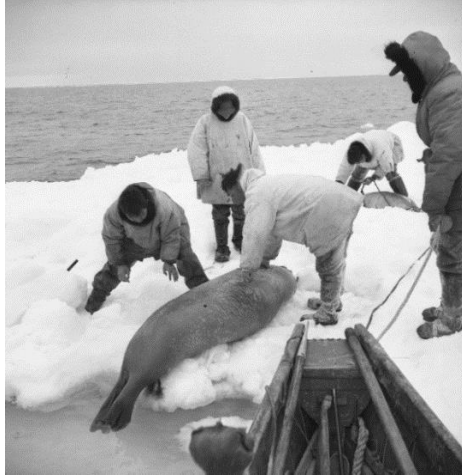
B1990.014.5.AKNative.3.170 Men hunters pulling out a dead seal.