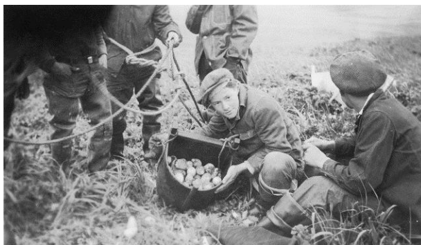
B1996.011.104 Young man holds a basket of collected murre eggs at Pribilof Island.