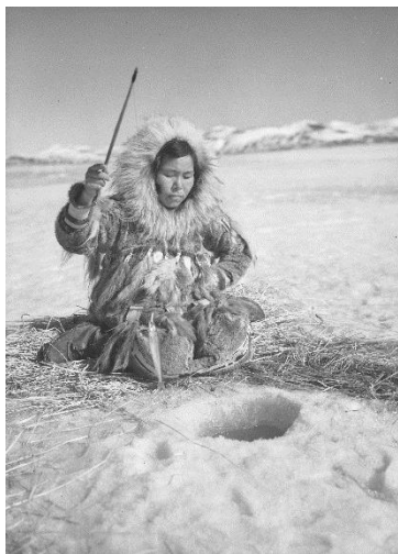
B1993.091.0171.R05 Woman ice fishing.