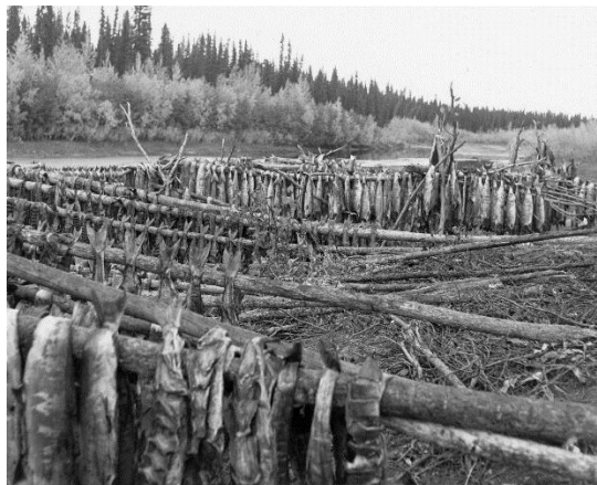
B1985.027.1212 Drying racks with fish in Fort Yukon, AK.