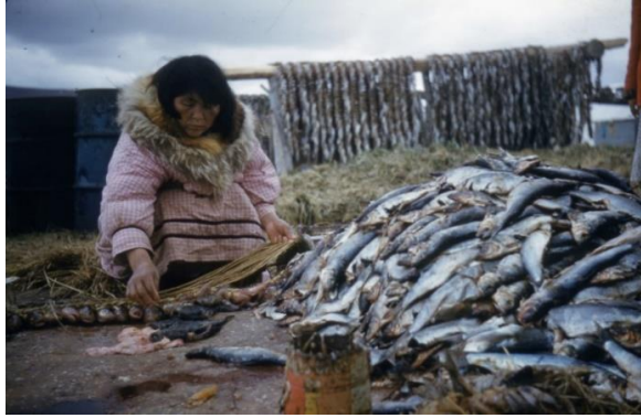
B1991.011.391 Woman braiding herring with rye grass for drying.