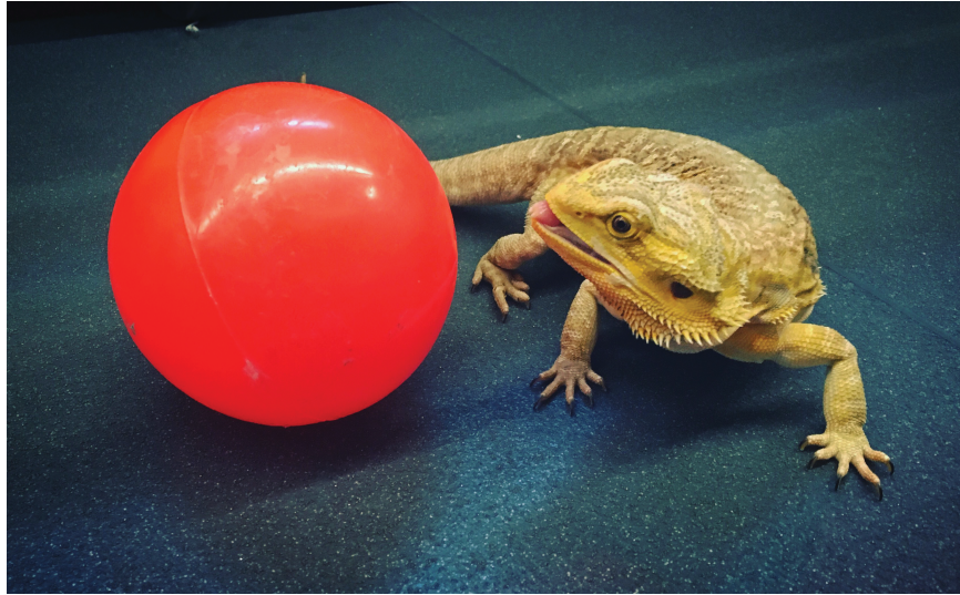
EVREN THE BEARDED DRAGON