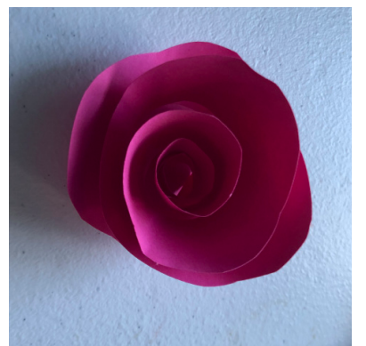
6. Once you reach the center, let go of the spiral and allow it to grow. Adjust the spiral as needed to shape it into a flower.