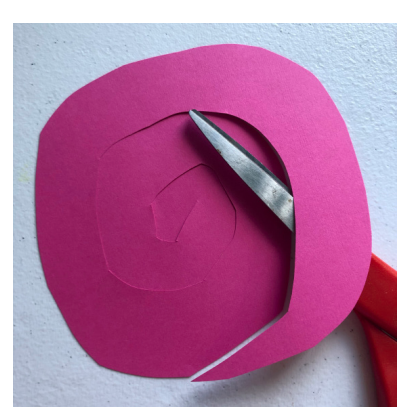
3. Cut the circle into a spiral.