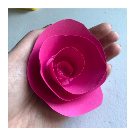
8. Ensure the center spirals are all glued securely onto the center of the spiral. Allow to dry.