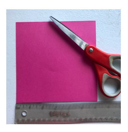
Cut a square of cardstock 6 inches x 6 inches