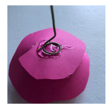
10. Glue the stem onto the bottom of the flower with hot glue. Allow to dry.