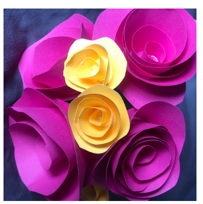
12. Create a varied bouquet using different size squares and colors of cardstock.