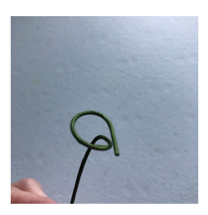
9. Bend floral stem into a circular shape on the top end. You may wish to use pliars to assist in the bending.