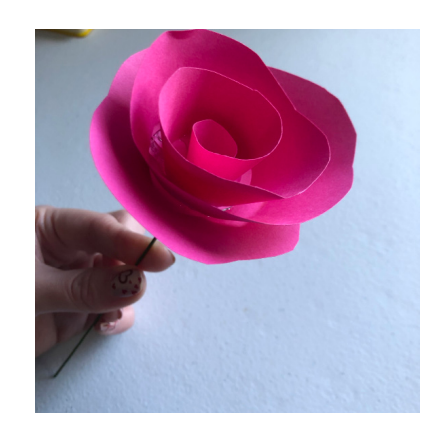
11. The finished flower should look something like this.