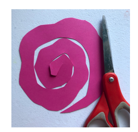
4. Cut a wavy line alongside the outer edge of the spiral.