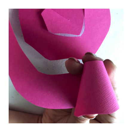
5. Roll the flower tightly starting from the outside and aligning the smooth edge of the spiral as you go.