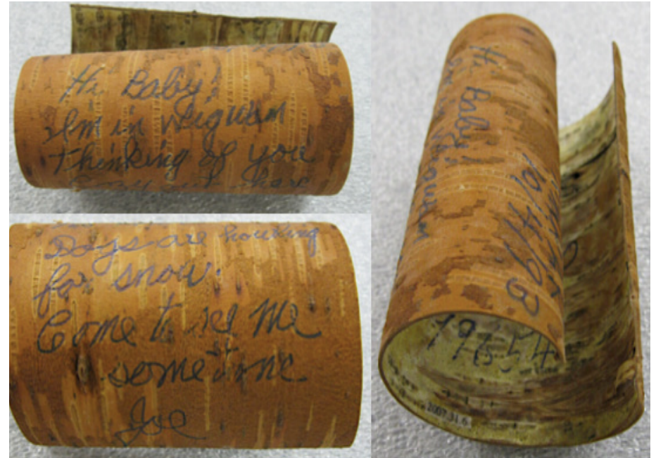
1993 Birch Bark Letter Redington Family Collection; Anchorage Museum, 2007.031.006

SHARE Invite students to share their initial thoughts and ideas with a partner. What is a letter? How does the act of writing a letter connect individuals? Invite students to share their thoughts and ideas with a partner.