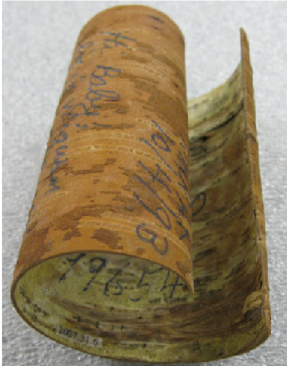
1993 Birch Bark Letter Redington Family Collection; Anchorage Museum, 2007.031.006