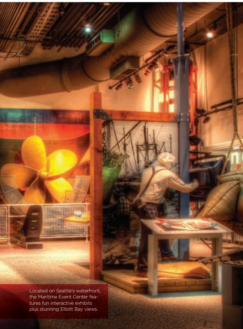
Located on Seattle's waterfront, the Maritime Event Center features fun interactive exhibits plus stunning Elliott Bay views.

THINK MUSEUMS ARE BORING AND STAIID? Think again. Here are some Northwest museums that are anything but stuffy, and they're all available to host a party that your guests will be raving about for months to come.